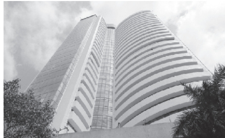
Bombay Stock Exchange - Fort, Mumbai