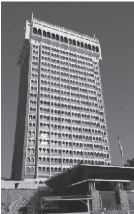
Taj Palace & Towers - Mumbai