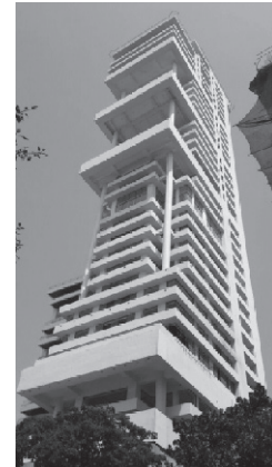
J.K. House (Raymond) Breach Candy, Mumbai