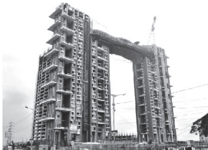
Forum Atmosphere - Kolkata

SPECIALISTS IN STRUCTURAL REPAIR / GUNITING / WATERPROOFING / REHABILITATION & RENOVATION OF BUILDINGS / INTERNAL & EXTERNAL PAINTING / EXTERNAL FACADE TREATMENTS.